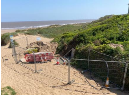
Anderby Creek radar column installation

We will be working in Anderby Creek from 5 June for 10 days, to connect electricity to the radar column. The work will involve excavating a trench from the beach to the road to install the power equipment. The work will be completed in phases to maintain public access.