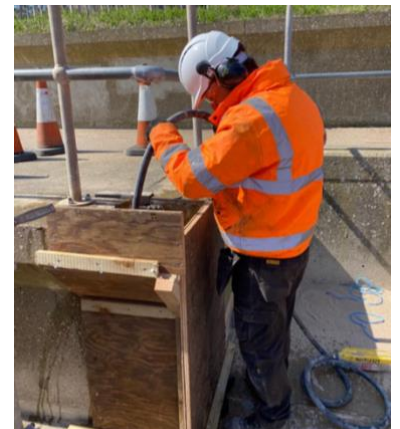
Working on the Skegness wave wall

Public access will be maintained at all times.