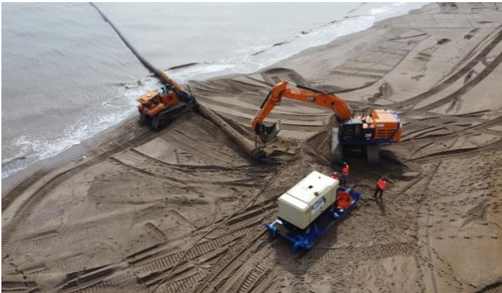
Moving the sinker line pipes into position

By restoring beach levels lost over the year, the Environment Agency protects its engineered sea defences from the impact of waves and tides.