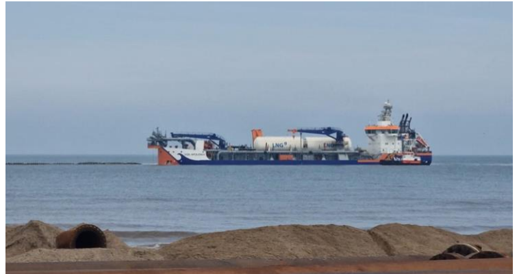
The dredger Vox Apolonia

For safety reasons, when work is taking place, sections of the beach will be closed to the public for short periods of time. We will only close the sections of the beach that we are working in. Please observe the beach closure signs, be careful with children, exercise caution with dogs and keep pets on a lead.